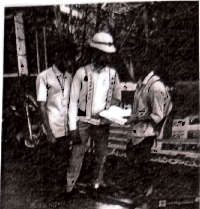
Visakhapatnam, Andhra Pradesh, भारत Annapurna Gardens, AP Pollution Control Board Rd, Vuda Layout, Madhavadhara, Visakhapatnam, Andhra Pradesh 530028, भारत Lat 17.752519° Long 83.244024° 28/09/22 03:10 PM GMT +05:30