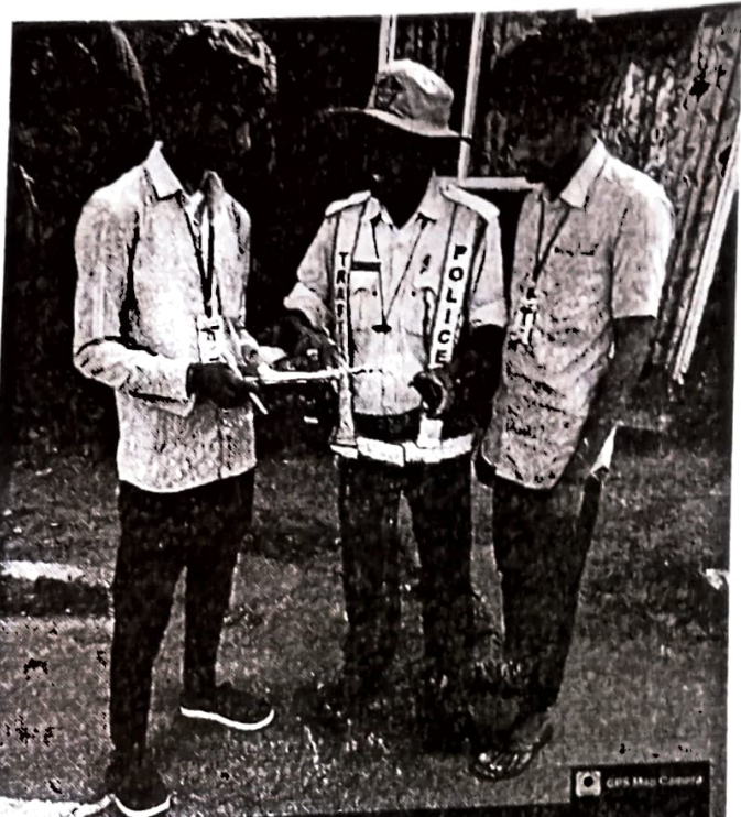
Visakhapatnam, Andhra Pradesh, भारत Annapurna Gardens, AP Pollution Control Board Rd, Vuda Layout, Madhavadhara, Visakhapatnam, Andhra Pradesh 530028, भारत Lat 17.752519° Long 83.244024° 28/09/22 02:55 PM GMT +05:30