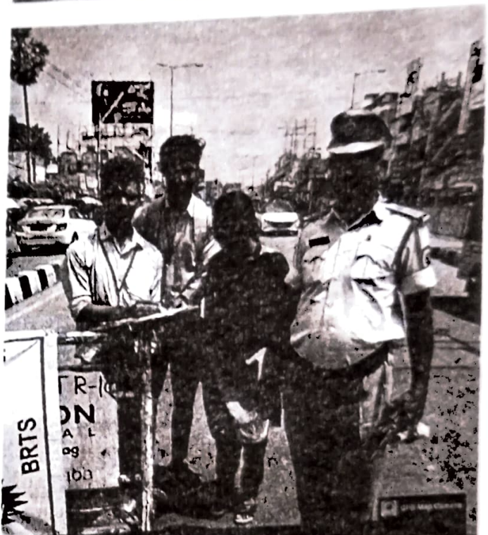
Visakhapatnam, Andhra Pradesh, भारत Annapurna Gardens, AP Pollution Control Board Rd, Vuda Layout, Madhavadhara, Visakhapatnam, Andhra Pradesh 530028, भारत Lat 17.752519° Long 83.244024° 28/09/22 12:20 PM GMT +05:30